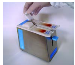
Step 5 : Clean glass