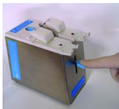
Step 3 : Press down