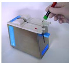
Step 2: Drop blood