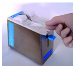
Step 1: Place slide

Specifications: 6' x 4' x 6' (L x W x H) 3.2 lbs. • 15cm x 10cm x 15cm (L x W x H) (1.45 Kg)