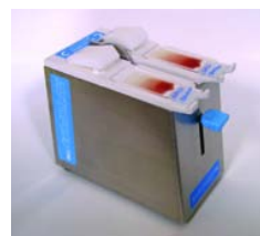
Step 4: Release